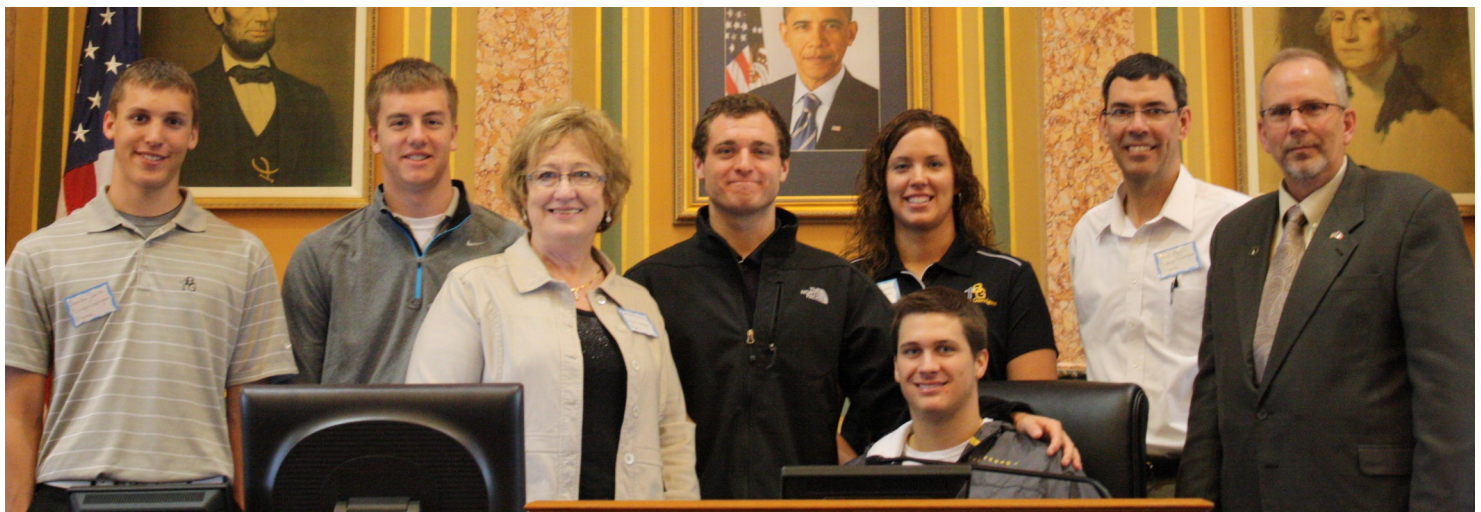
This group that attended the non-public school Legislative forum in Des Moines. Attendees were:

Our religion series has a nice parent component for parent and student reference. Another resource available to you is www.JClubCatholic.org . It is put out by the Paulines. It is full of wonderful materials for all different levels: Catholic jigsaw puzzles, saint of the day, jokes, coloring pages, music, mysteries of the rosary, etc. that talk to you and play music also. I found the sight to be very entertaining, educational and faith-filled. Would be a good alternative for summer rainy days. Enjoy.